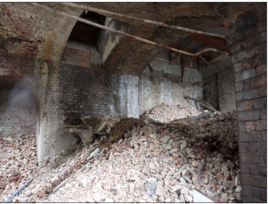
EXISTING PARTIALLY COLLAPSED VAULTS CONNECTED TO LISTED VIADUCT ON BRAITHWAITE ST TO BE REMOVED.